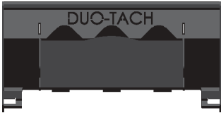
DUO-TACH® BLANK PLATE