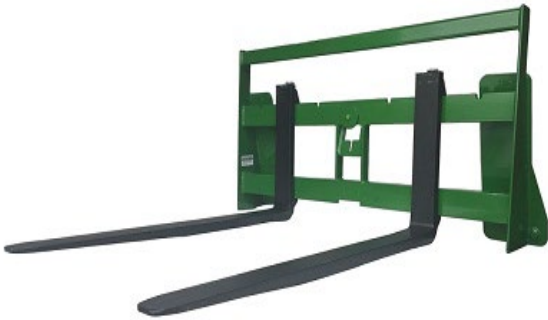
Compact Tractor Pallet Forks

Designed to handle up to a 2000 pound load