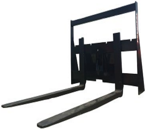
Mini Skid Steer

Medium duty class II at 4000 lbs., heavy duty class II class III at 8000 lbs. load capacity