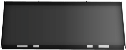
SKID STEER WELD-ON MOUNT BLANK