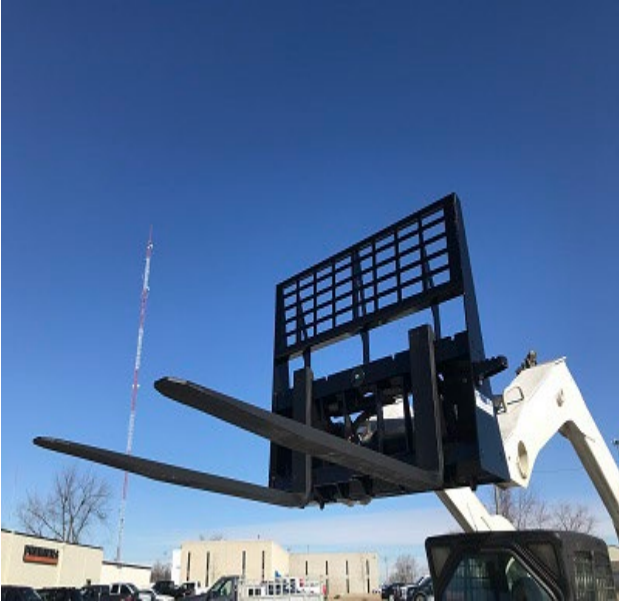
Skid Steer Loader

Premier Attachments' Pallet Forks are available for use with a variety of equipment and ship completely assembled, ready to take on the toughest jobs. Our Pallet Forks are designed to work on Compact Tractor Loaders, Mini Skid Steer Loaders, Skid Steer Loaders